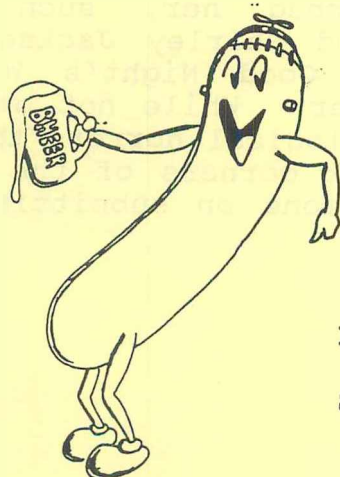
FRANK 'N STEIN